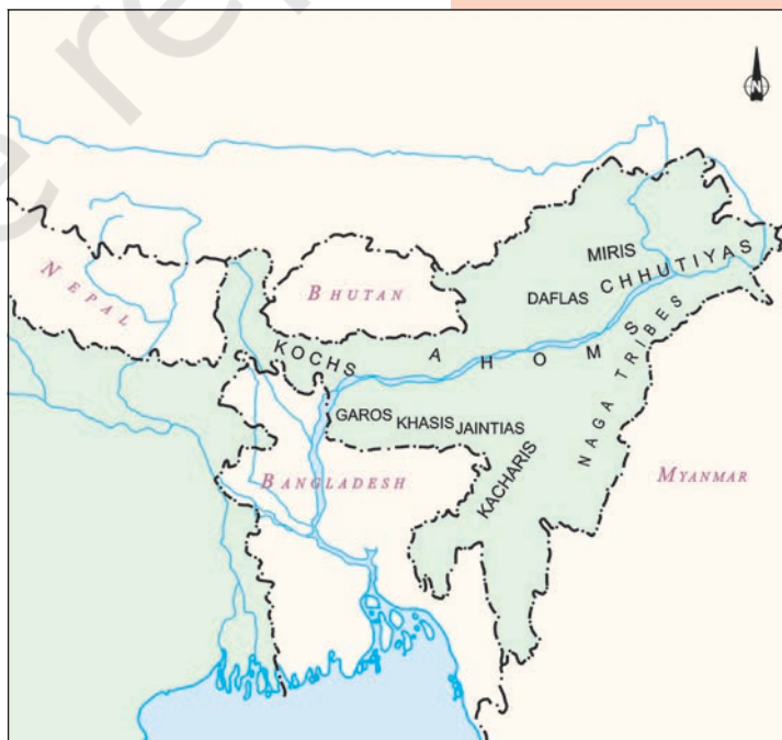
Map 3 Tribes of eastern India.

Discuss why the Mughals were interested in the land of the Gonds.