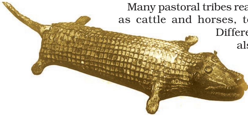
Fig. 4 Bronze crocodile, Kutiya Kond tribe, Orissa.

Many pastoral tribes reared and sold animals, such as cattle and horses, to the prosperous people. Different castes of petty pedlars also travelled from village to village. They made and sold wares such as ropes, reeds, straw matting and coarse sacks. Sometimes mendicants acted as wandering merchants. There were castes of entertainers who performed in different towns and villages for their livelihood.