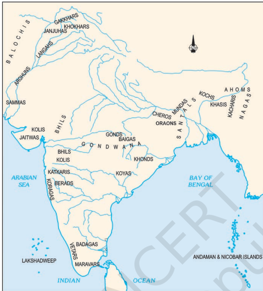
Map 1 Location of some of the major Indian tribes.

tribe in the north-west. They were divided into many smaller clans under different chiefs. In the western Himalaya lived the shepherd tribe of Gaddis. The distant north-eastern part of the subcontinent too was entirely dominated by tribes – the Nagas, Ahoms and many others.