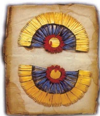
Fig. 7 Ear ornaments, Kobo Naga tribe, Manipur.