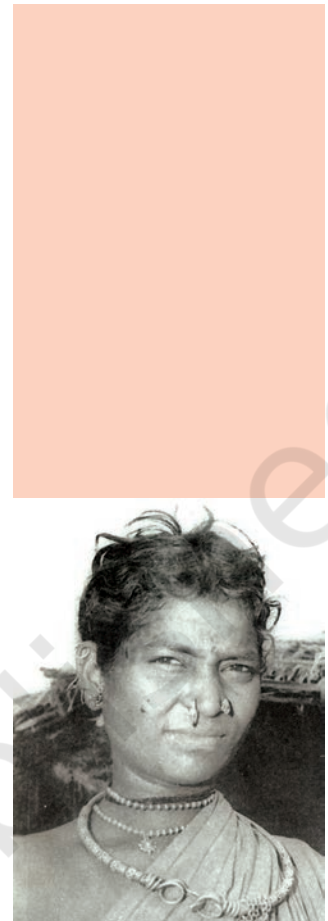
Fig. 5 A Gond woman.

The administrative system of these kingdoms was becoming centralised. The kingdom was divided into