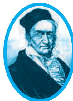
Carl Friedrich Gauss (1777 – 1855)

Carl Friedrich Gauss is often referred to as the 'Prince of Mathematicians' and is considered one of the three greatest mathematicians of all time, along with Archimedes and Newton. He has made fundamental contributions to both mathematics and science.