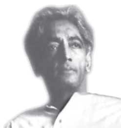
J. Krishnamurti 1895-1986

Jiddu Krishnamurti was a world renowned writer and speaker on fundamental philosophical and spiritual subjects such as the purpose of meditation, human relationships, and how to bring about positive change in global society. His supporters, working through several non-profit foundations, oversee a number of independent schools centred on his views on education, in India, England and the United States. His talks, group and individual discussions, and other writings are published in a variety of formats including print, audio-video as well as online, in many languages.