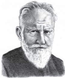
G.B. Shaw 1856-1950

George Bernard Shaw was a dramatist and critic. His work as a London newspaper critic of music and drama resulted in The Quintessence of Ibsenism . His famous plays include Arms and the Man , Candida and Man and Superman . His works present a fearless intellectual criticism, sugar-coated by a pretended lightness of tone. He rebelled against muddled thinking, and sought to puncture hollow pretensions.