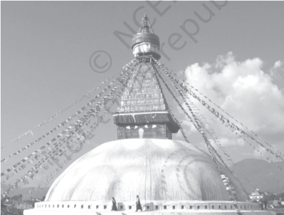
The Baudhnath Stupa, Kathmandu