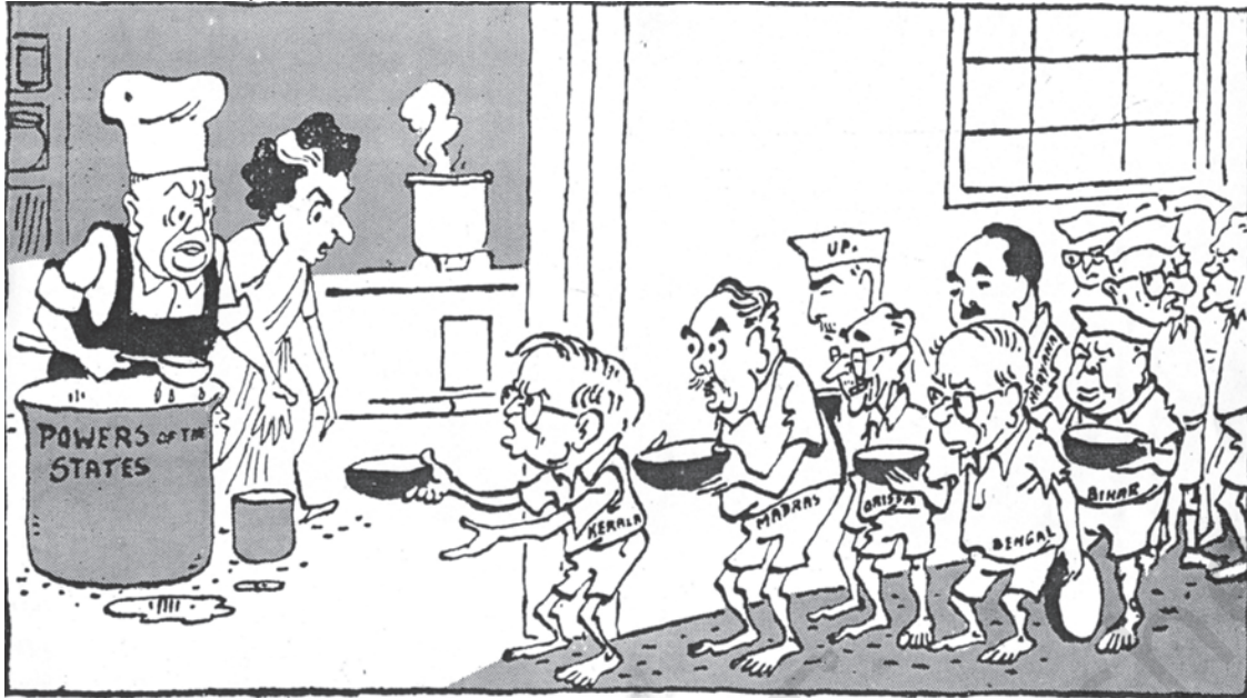
© Kutty - Laughing with Kutty