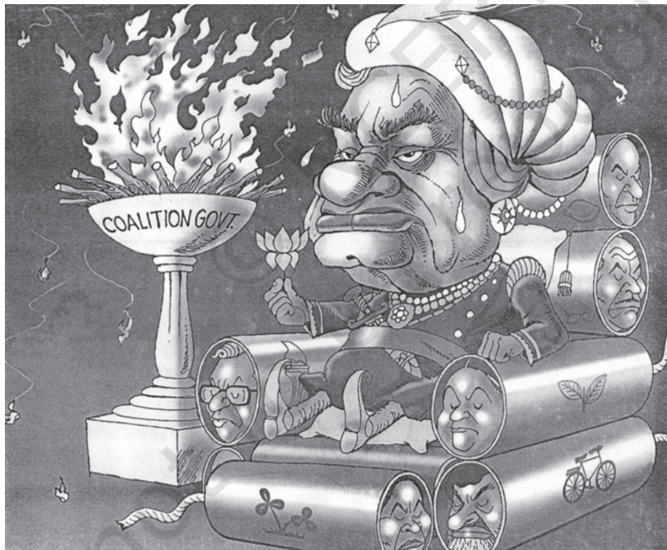
© Ajith Ninan - India Today Book of Cartoons

Here are two cartoons showing the relationship between Centre and States. Should the State go to the Centre with a begging bowl? How can the leader of a coalition keep the partners of government satisfied?