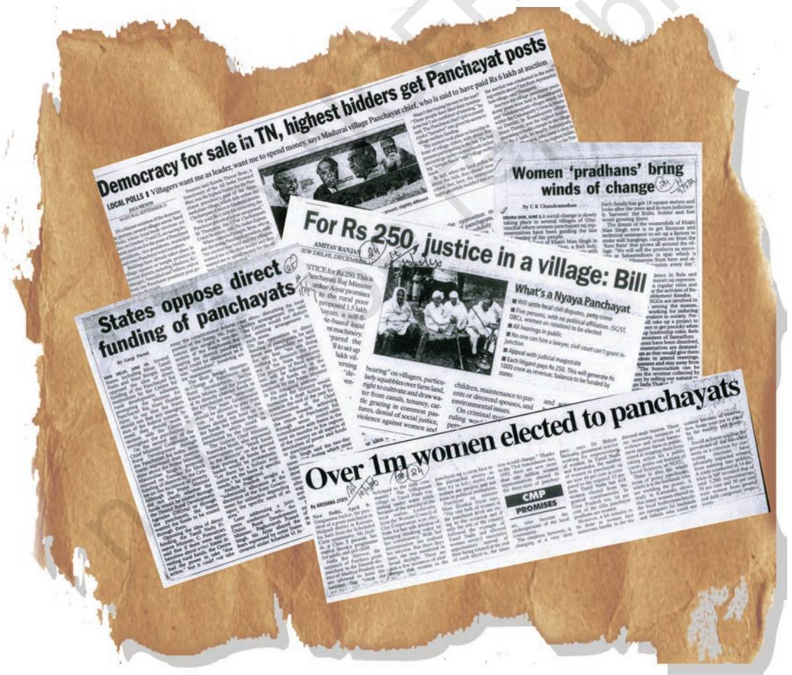
What do these newspaper clippings have to say about efforts of decentralisation in India?

Prime Minister runs the country. Chief Minister runs the state. Logically, then, the chairperson of Zilla Parishad should run the district. Why does the D.M. or Collector administer the district?