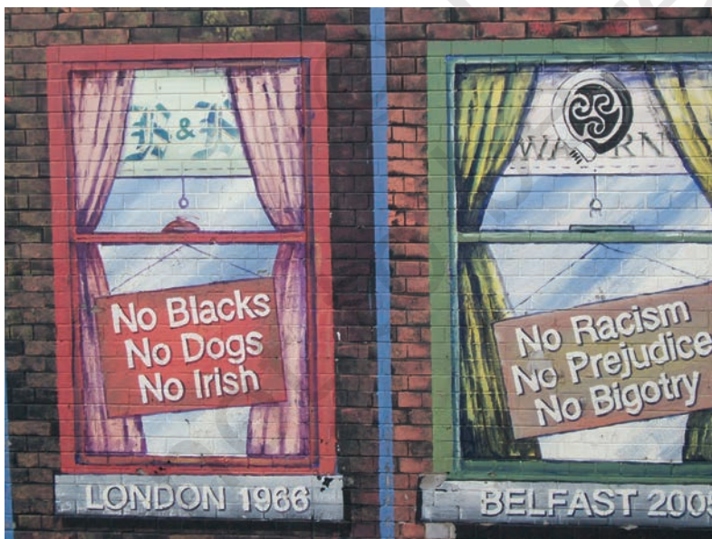
In some societies of Northern Ireland, the colonies of Protestant and Catholic communities are divided by walls. These walls are sometimes filled with graffiti as you can see here. The Irish Republican Army and British Government signed an agreement in 2005. What does the graffiti here tell about the conflict in the society?

Second, it depends on how political leaders raise the demands of any community. It is easier to accommodate demands that are within the constitutional framework and are not at the cost of another community.