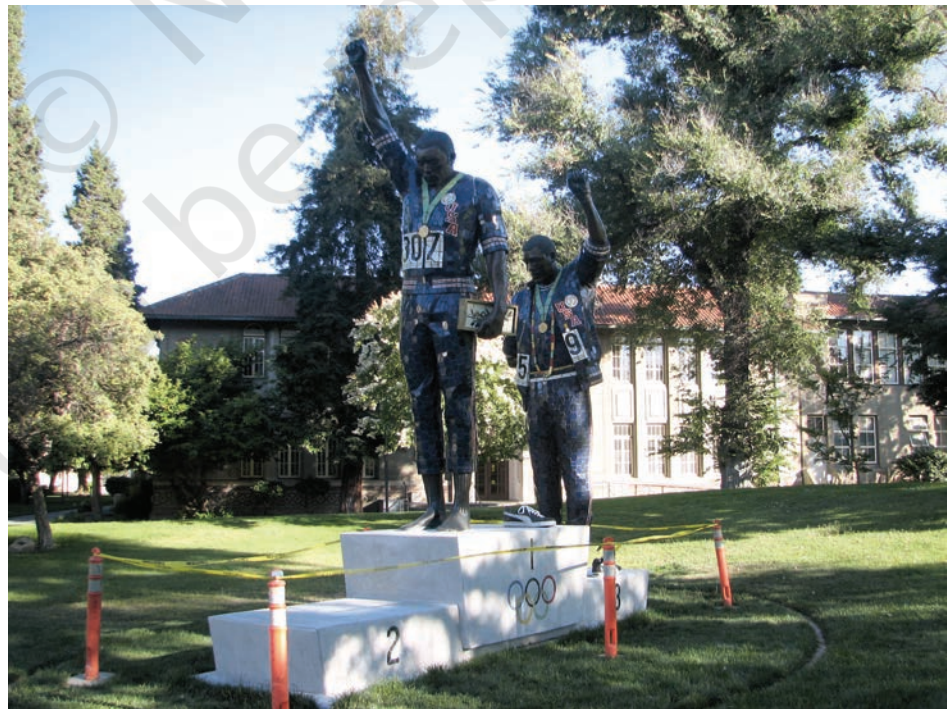
In 2005, the San Jose State University installed a 20-foot high sculpture representing the protest by Tommie Smith and John Carlos. A photograph of the original medal ceremony in 1968 is on the top.

Do you think that Carlos and Smith should have raised an internal matter of American society in an international forum? Would you say that what they did was political? Why do you think Peter Norman, who was neither Black nor American, joined in the gesture of protest? If you were in Norman's place what would you do?