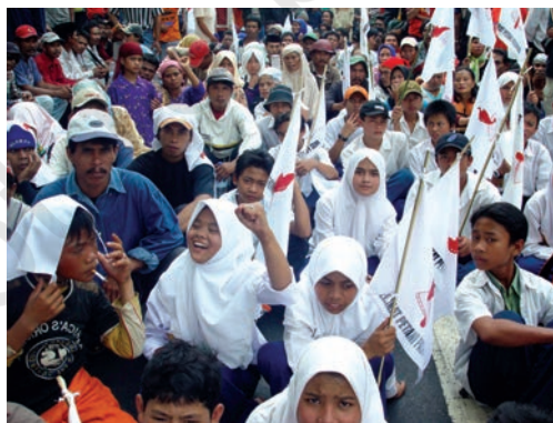
Land rights protest: farmers of West Java, Indonesia. In June 2004, about 15,000 landless farmers from West Java, travelled to Jakarta, the capital city. They came with their families to demand land reform, to insist on the return of their farms. Demonstrators chanted, "No land, No vote" declaring that they would boycott Indonesia's first direct presidential election if no candidate backed land reform.