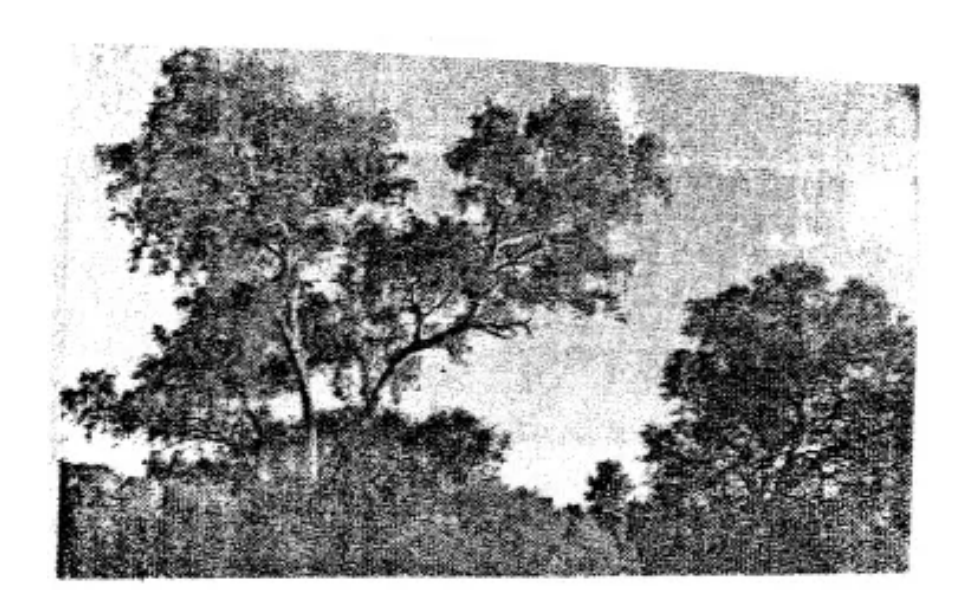
Question 1. What is the local name of this tree?