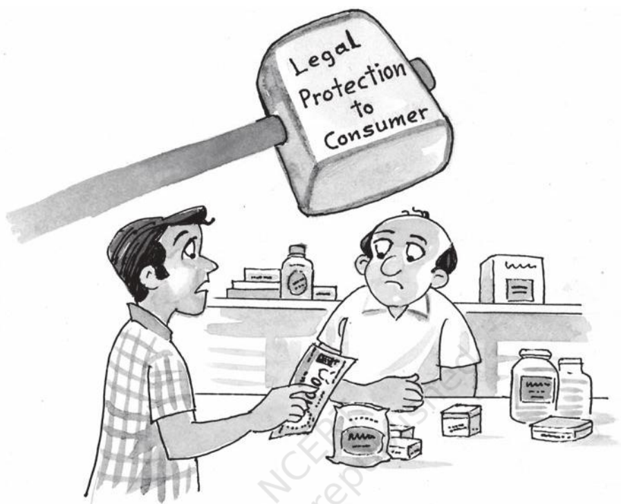
Protection against malpractices and exploitation

remedies available to parties in case of breach of contract.