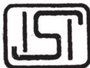
Mark of Bureau of Indian Standards