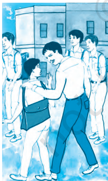
Fig. 2.2 : Parent-child Communication

Anxiety is not abnormal. Everyone gets the feeling of anxiety sometime or the other. Anxiety is an apprehension of something unpleasant or some danger. It causes mental discomfort and pain. It may sometimes prove to be useful, for example, before an examination or competition. But an abnormally high level of anxiety is counter productive as it distracts and lowers the span of attention. Adolescents sometimes panic out of anxiety without knowing the reason. They may even feel a fear of failure in future. This makes them tense and tired. Anxiety may