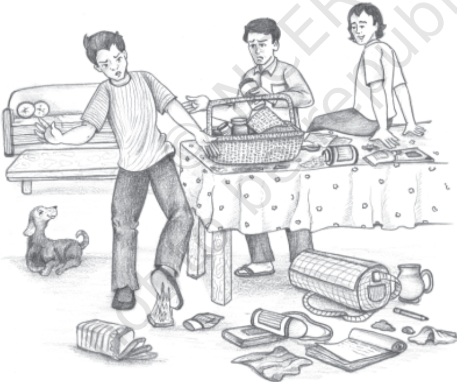
George trod on the butter.