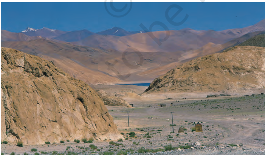
The dry barren landscape of the mountainous desert of Ladakh.

Ladakh is a desert in the mountains in the east of Jammu and Kashmir. Very little agriculture is possible here since this region does not receive any rain and is covered in snow for a large part of the year. There are very few trees that can grow in the region. For drinking water, people depend on the melting snow during the summer months.