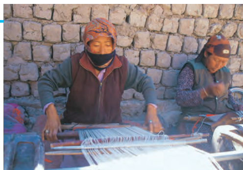
Woman weaving a pashmina shawl

Buddhism reached Tibet via Ladakh. Ladakh is also called Little Tibet. Islam was introduced in this region more than four hundred years ago and there is a significant Muslim population here. Ladakh has a very rich oral tradition of songs and poems. Local versions of the Tibetan national epic the Kesar Saga are performed and sung by both Muslims and Buddhists.