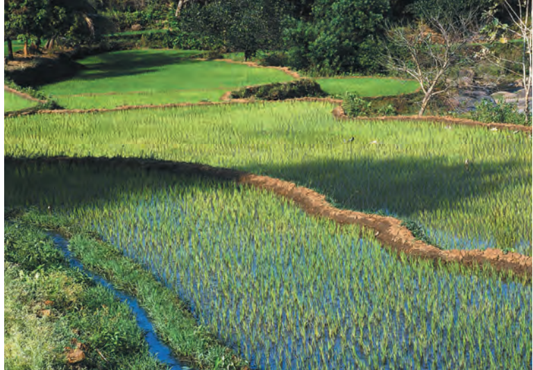
Transplanted paddy growing in a few of Ramalingam's 20 acres. A result of hard labour performed by agricultural workers like Thulasi.

This is when we can say they are caught in debt. In recent years this has become a major cause of distress among farmers. In some areas this has also resulted in many farmers committing suicide.