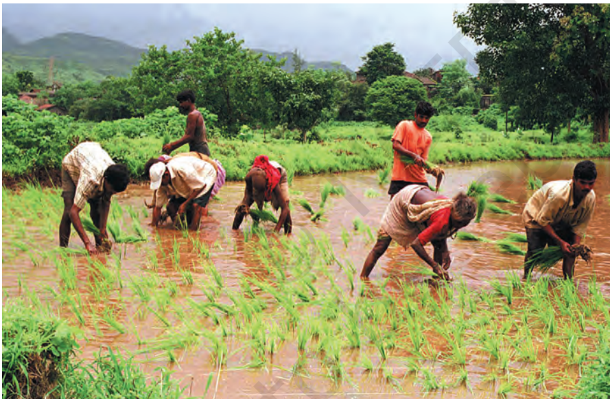
Transplanting paddy is back-breaking work.

The village is surrounded by low hills. Paddy is the main crop that is grown in irrigated lands. Most of the families earn a living through agriculture.