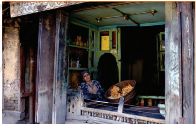
Can you tell what is shown in this picture? Every lane in Kashmir has a bakery. Kashmiri people don't cook roties in their homes, they buy it from such bakeries.

After a long journey Loner and I were about to reach Mumbai. My heart felt heavy. I also felt that my motorcycle did not want to come back. I was happy that I had learnt and experienced so many new things. I had also brought back some memories in my camera. And of course, this was not the end! Next time when Loner and I get bored of the city, we will again set out for a new journey!