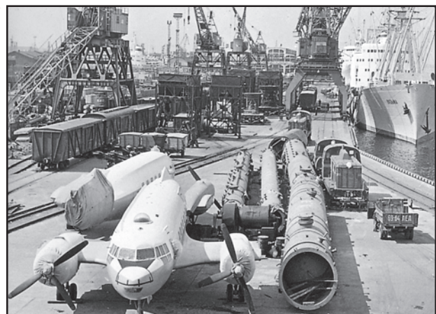
Fig. 9.6: Leningrad Commercial Port