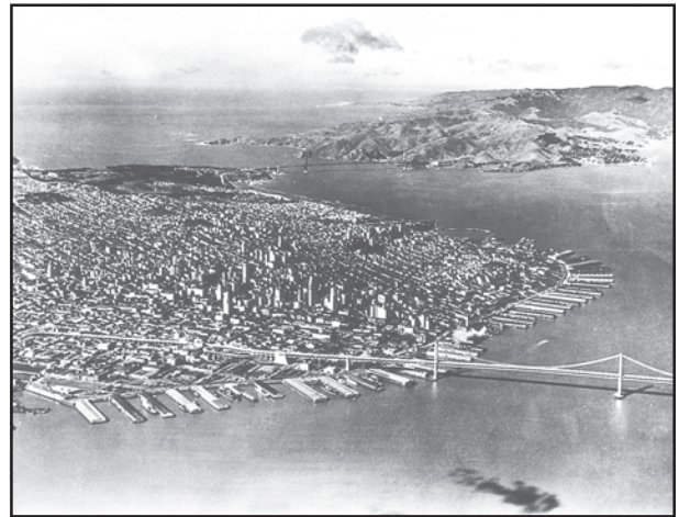
Fig. 9.5: San Francisco, the largest land-locked harbour in the world

The ports provide facilities of docking, loading, unloading and the storage facilities for cargo. In order to provide these facilities, the port authorities make arrangements for maintaining navigable channels, arranging tugs and barges, and providing labour and managerial services. The importance of a port is judged by the size of cargo and the number of ships handled. The quantity of cargo handled by a port is an indicator of the level of development of its hinterland.