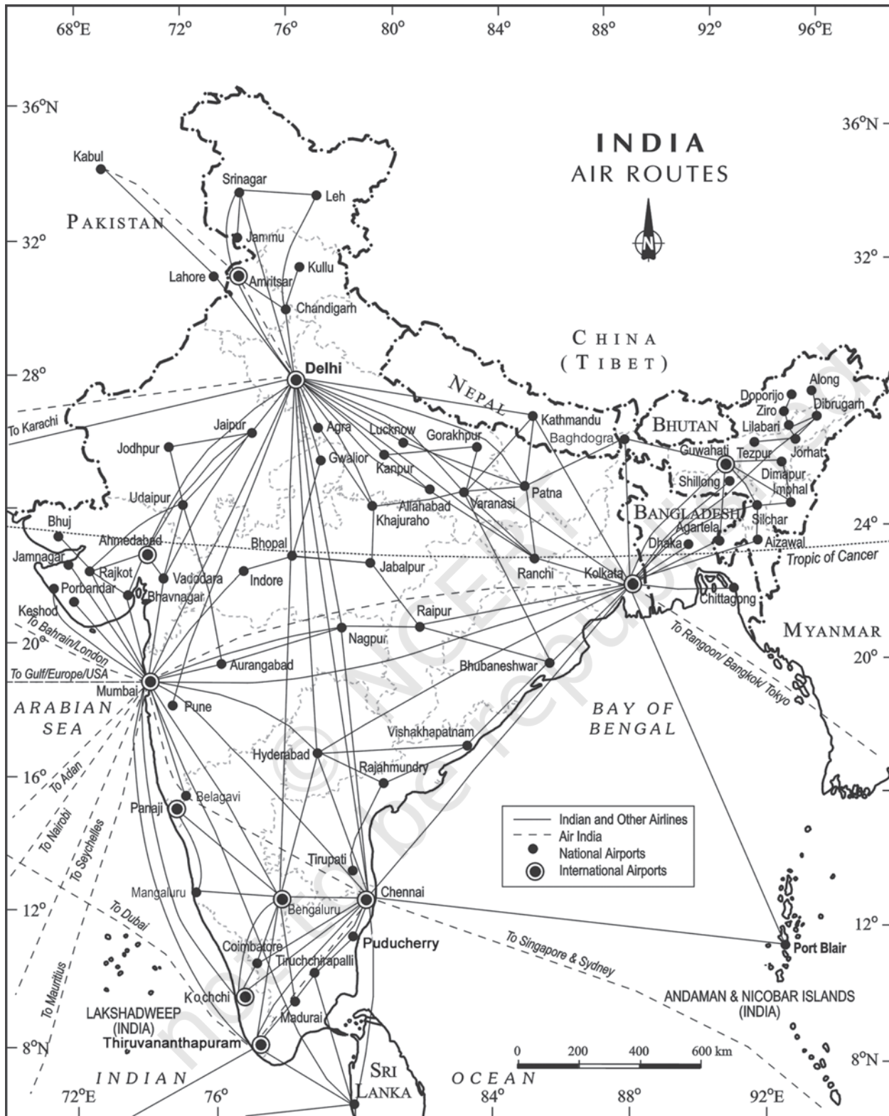
Fig. 11.5 : India – Air Routes