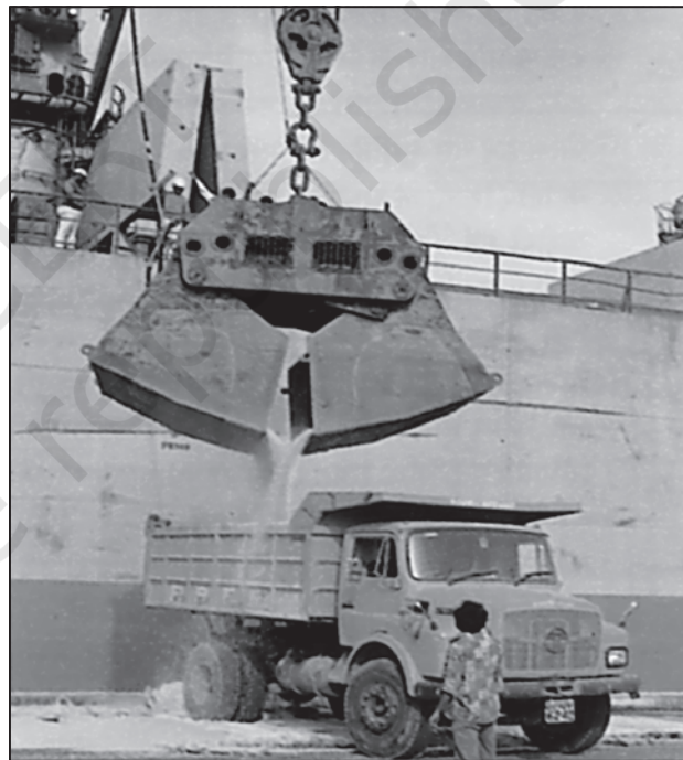
Fig. 11.3 : Unloading of goods on port

India is surrounded by sea from three sides and is bestowed with a long coastline. Water provides a smooth surface for very cheap transport provided there is no turbulence. India