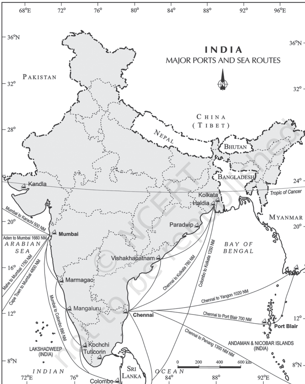
Fig. 11.4 : India – Major Ports and Sea Routes