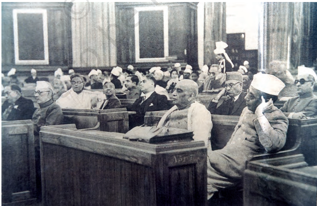
Fig. 15.4 The Constituent Assembly in session Sardar Vallabh Bhai Patel is seen sitting second from right.

The discussions within the Constituent Assembly were also influenced by the opinions expressed by the public. As the deliberations continued, the arguments were reported in newspapers, and the proposals were publicly debated. Criticisms and