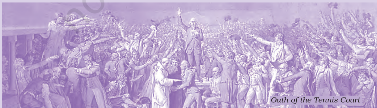
Oath of the Tennis Court

CONSTITUENT ASSEMBLY DEBATES (CAD), VOL. I