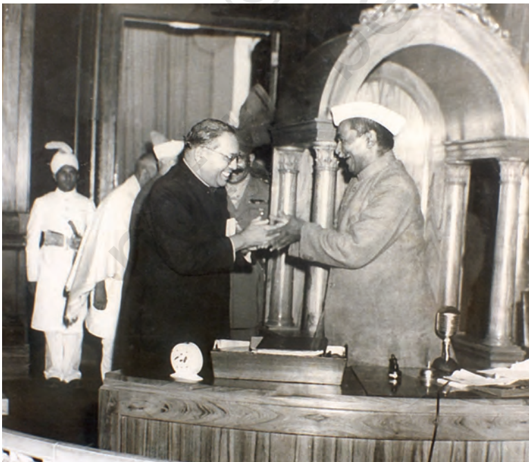
Fig. 15. 9 B. R. Ambedkar and Rajendra Prasad greeting each other at the time of the handing over of the Constitution

The Constituent Assembly debates help us understand the many conflicting voices that had to be negotiated in framing the Constitution, and the many demands that were articulated. They tell us about the ideals that were invoked and the principles that the makers of the Constitution operated with. But in reading these debates we need to be aware that the ideals invoked were very often re-worked according to what seemed appropriate within a context. At times the members of the Assembly also changed their ideas as the debate unfolded over three years. Hearing others argue, some members rethought their positions, opening their minds to contrary views, while others changed their views in reaction to the events around.