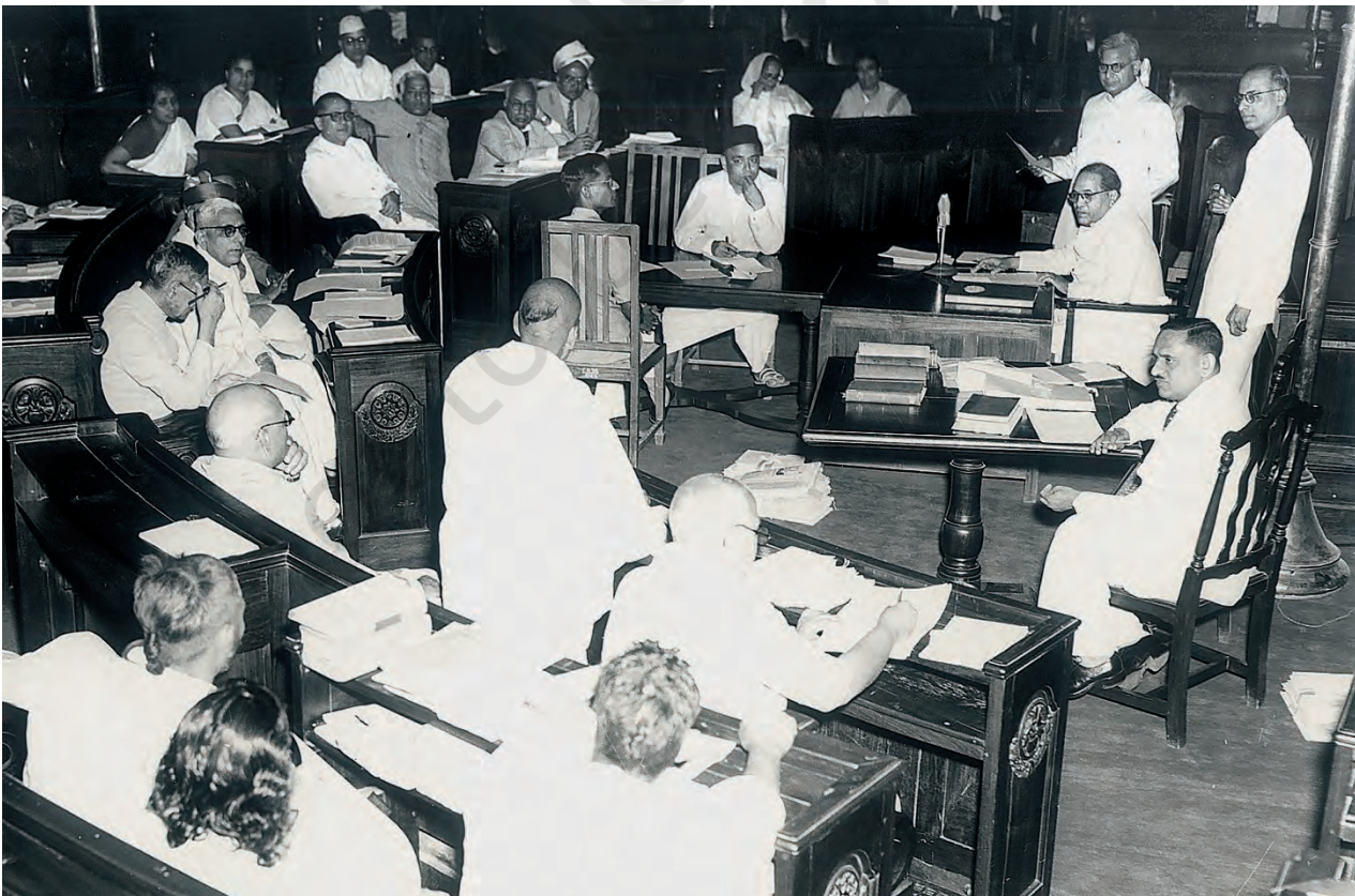
Fig. 15.5 B. R. Ambedkar presiding over a discussion of the Hindu Code Bill

Look again at Chapters 13 and 14. Discuss how the political situation of the time may have shaped the nature of the debates within the Constituent Assembly.