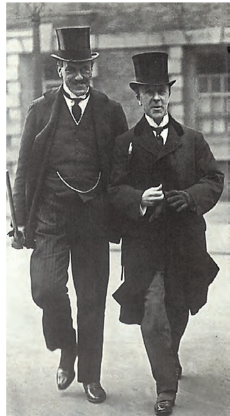
Fig. 15.7 Edwin Montague (left) was the author of the Montague-Chelmsford Reforms of 1919 which allowed some form of representation in provincial legislative assemblies.

➤ Why does the speaker in Source 2 think that the Constituent Assembly was under the shadow of British guns?