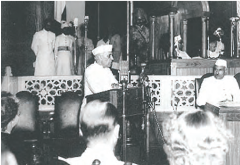
Fig. 15.3 Jawaharlal Nehru speaking in the Constituent Assembly at midnight on 14 August 1947

It was on this day that Nehru gave his famous speech that began with the following lines: