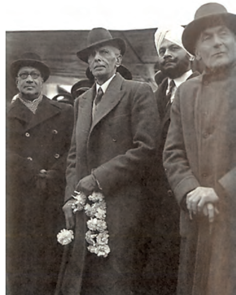
Fig. 15.8 In the winter of 1946 Indian leaders went to London for what turned out to be a fruitless round of talks with British Prime Minister Attlee. (Left to right: Liaquat Ali, Mohammad Ali Jinnah, Baldev Singh and Pethick-Lawrence)