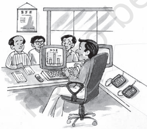
Electronic Trading System