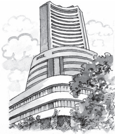
Bombay Stock Exchange