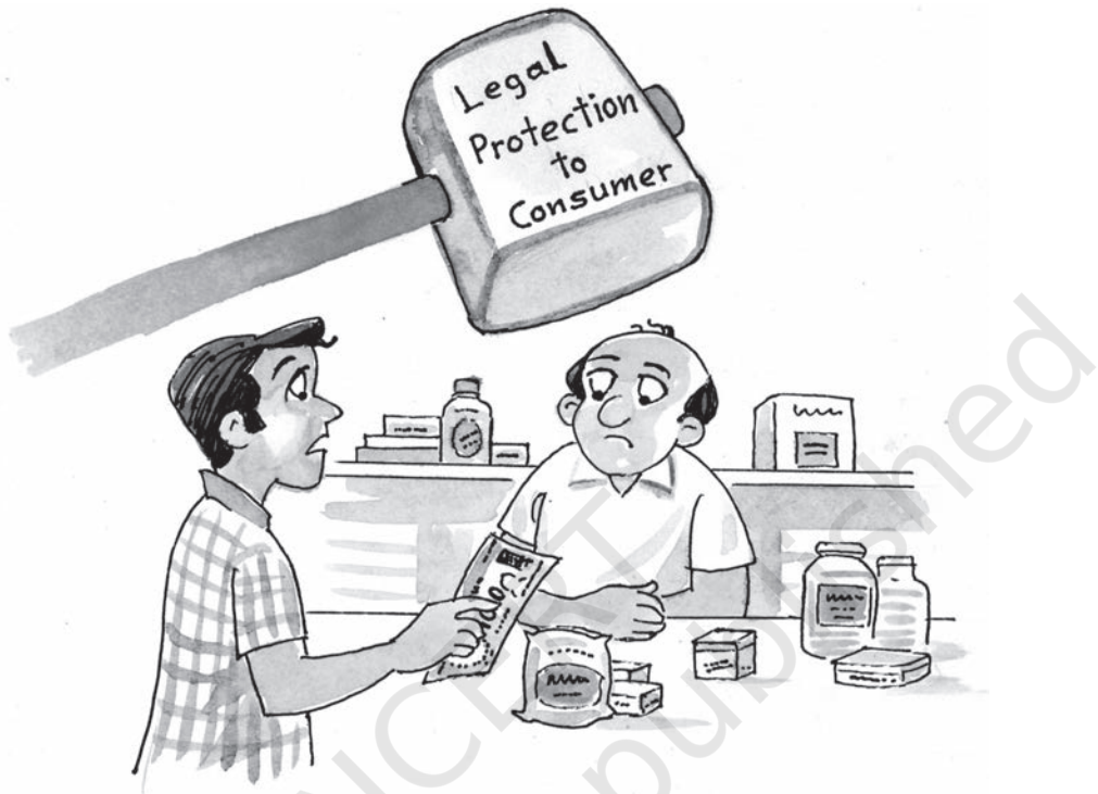
Protection against malpractices and exploitation

remedies available to parties in case of breach of contract.