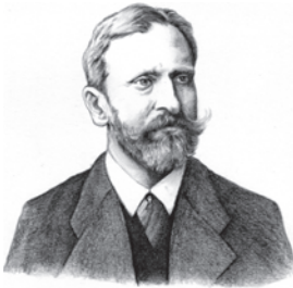
Joseph Conrad 1857-1924

Joseph Conrad, born of Polish parents in the Russian Ukraine, began a seafaring life in 1874. He learnt English at the age of 21, and in 1886 became a British citizen. His famous works include The Nigger of the Narcissus (1898), Lord Jim (1900) and Nostromo (1904). His greatest skill lies in his capacity to evoke an atmosphere through careful attention to detail. He uses the method of story within a story to convey his sense of the inexplicable inner character of life and the shifting quality of the mind. All Conrad's characters suffer from a sense of isolation.