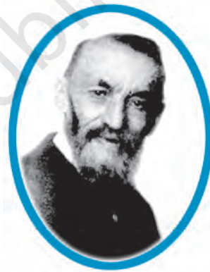
G. Peano (1858-1932)

In contrast to deduction, inductive reasoning depends on working with each case, and developing a conjecture by observing incidences till we have observed each and every case. It is frequently used in mathematics and is a key aspect of scientific reasoning, where collecting and analysing data is the norm. Thus, in simple language, we can say the word induction means the generalisation from particular cases or facts.