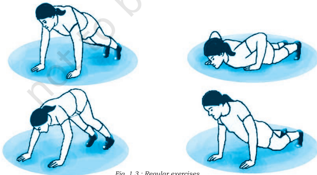
Fig. 1.3 : Regular exercises

One must do 20–30 minutes of physical activity daily to keep fit. This can be done by taking part in sports. Exercising or spot jogging can be done at home. Simple walking, climbing stairs, not using the lift and skipping have the same effect. Gym is another dedicated place for workouts.