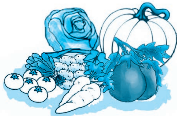
Fig. 1.2 : Healthy Diet

Eating a balanced diet helps in the prevention of obesity and other lifestyle diseases. The balanced diet includes fruits and vegetables, preferably locally available and seasonal, wholegrain products (including pulses), milk and milk products.