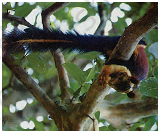
Fig. 7.3 (b) : Giant squirrel

endemic flora of the Pachmarhi Biosphere Reserve. Bison, Indian giant squirrel [Fig. 7.3 (b)] and flying squirrel are endemic fauna of this area. Professor Ahmad explains that the destruction of their habitat, increasing population and introduction of new species may affect the natural habitat of endemic species and endanger their existence.