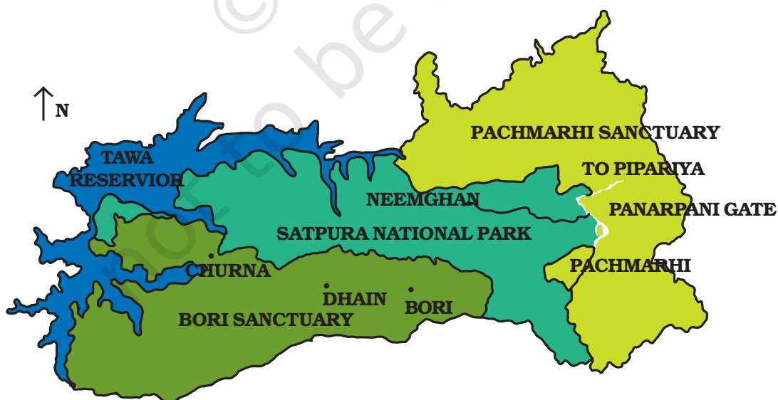
Fig. 7.1 : Pachmarhi Biosphere Reserve