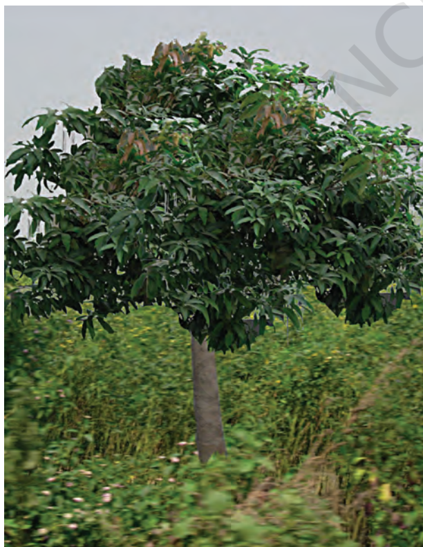
Fig. 7.3 (a) : Wild Mango

Madhavji shows sal and wild mango (Fig. 7.3 (a)) as two examples of the