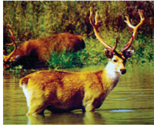
Fig. 7.6 : Barasingha

animals has become difficult because of disturbances in their natural habitat. Professor Ahmad tells them that in order to protect plants and animals strict rules are imposed in all National Parks. Human activities such as grazing, poaching, hunting, capturing of animals or collection of firewood, medicinal plants, etc. are not allowed