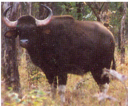
Fig. 7.5 : Wild buffalo

buffaloes (Fig. 7.5) and barasingha (Fig. 7.6) were also found in the Satpura National Park. Animals whose numbers are diminishing to a level that they might face extinction are known as the endangered animals . Boojho is reminded of the dinosaurs which became extinct a long time ago. Survival of some