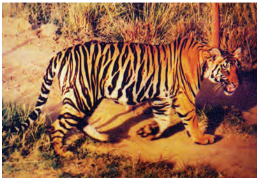
Fig. 7.4 : Tiger

Tiger (Fig. 7.4) is one of the many species which are slowly disappearing from our forests. But, the Satpura Tiger Reserve is unique in the sense that a significant increase in the population of tigers has been seen here. Once upon a time, animals like lions, elephants, wild