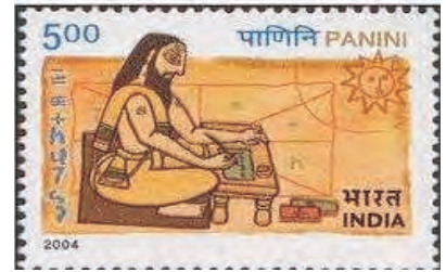
Postage stamp of Indian grammarian, Panini

Takshashila became famous as a place of learning due to its teachers' expertise. Among its noted pupils were the legendary Indian grammarian, Panini. He was an expert in language and grammar and authored one of the greatest works on grammar called Ashtadhyayi . Jivaka, one of the most renowned physicians in ancient India, and Chanakya (also known as Kautilya), a skilled exponent of statecraft, both studied here. Students came to Takshashila from Kashi, Kosala, Magadha and also from other countries in spite of the long and arduous journey they had to undertake.