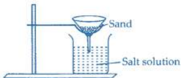
Fig. : Filtration

3. Evaporate the salt solution. Hence salt is separated.