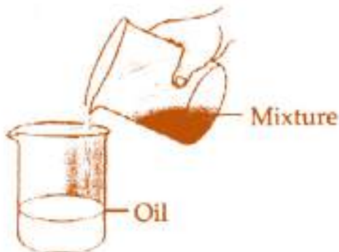
Fig. : Decantation