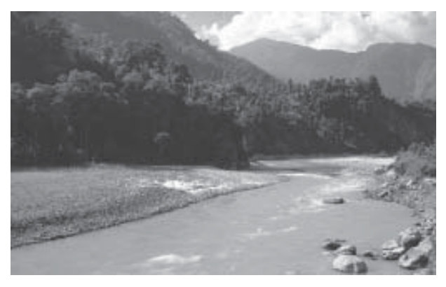
Figure 3.1 : A River in the Mountainous Region

2006) in this class . Can you, then, explain the reason for water flowing from one direction to the other? Why do the rivers originating from the Himalayas in the northern India and the Western Ghat in the southern India flow towards the east and discharge their waters in the Bay of Bengal?