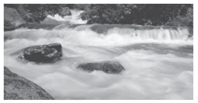
Figure 3.3 : Rapids

The Himalayan drainage system has evolved through a long geological history. It mainly includes the Ganga, the Indus and the Brahmaputra river basins. Since these are fed both by melting of snow and precipitation, rivers of this system are perennial. These rivers pass through the giant gorges carved out by the erosional activity carried on simultaneously with the uplift of the Himalayas. Besides deep gorges, these rivers also form V-shaped valleys, rapids and waterfalls in their mountainous