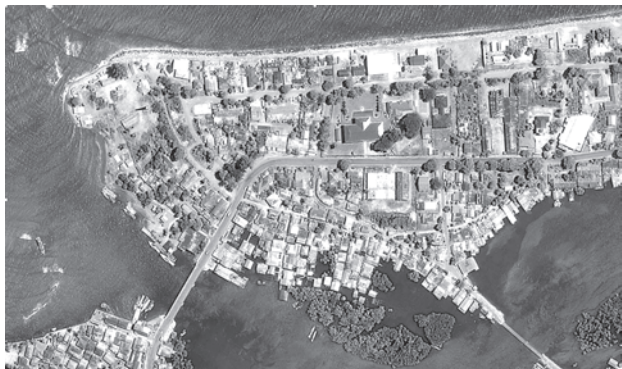
Band Aceh, June, 2004