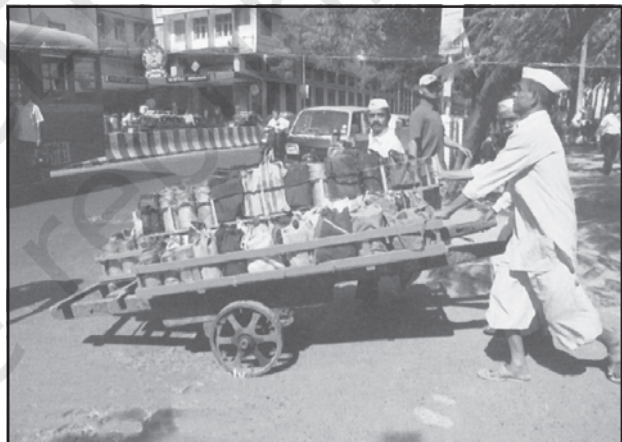
Fig. 7.4: Dabbawala Service in Mumbai

Personal services are made available to the people to facilitate their work in daily life. The workers migrate from rural areas in search of employment and are unskilled. They are employed in domestic services as housekeepers, cooks, and gardeners. This segment of workers is generally unorganised. One such example in India is Mumbai's dabbawala (Tiffin) service provided to about 1,75,000 customers all over the city.