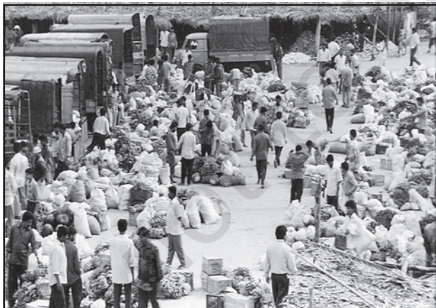
Fig. 7.2: A Wholesale Vegetable Market

Rural marketing centres cater to nearby settlements. These are quasi-urban centres. They serve as trading centres of the most rudimentary type. Here personal and professional services are not well-developed. These form local collecting and distributing centres. Most of these have mandis (wholesale markets) and also retailing areas. They are not urban centres per se but are significant centres for making available goods and services which are most frequently demanded by rural folk.