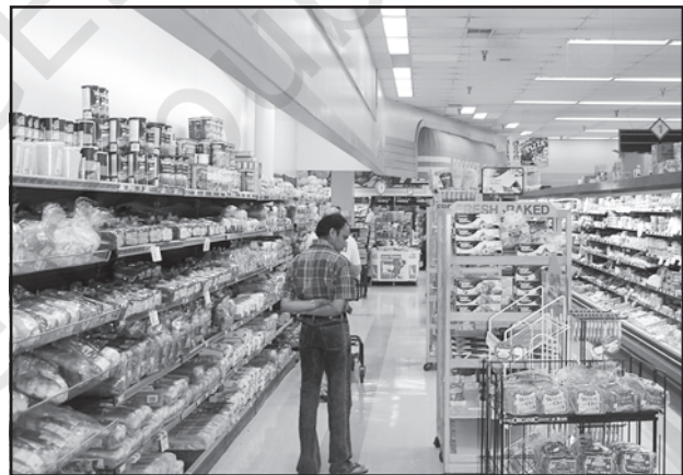
Fig. 7.3: Packed Food Market in U.S.A.

Urban marketing centres have more widely specialised urban services. They provide ordinary goods and services as well as many of the specialised goods and services required by people. Urban centres, therefore, offer manufactured goods as well as many specialised markets develop, e.g. markets for labour, housing, semi or finished products. Services of educational institutions and professionals such as teachers, lawyers, consultants, physicians, dentists and veterinary doctors are available.