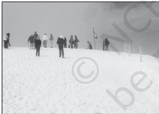
Fig. 7.5: Tourists skiing in the snow capped mountain slopes of Switzerland

Tourism is travel undertaken for purposes of recreation rather than business. It has become the world's single largest tertiary activity in total registered jobs (250 million) and total revenue (40 per cent of the total GDP). Besides, many local persons, are employed to provide services like accommodation, meals, transport, entertainment and special shops serving the tourists. Tourism fosters the growth of infrastructure industries, retail trading, and craft industries (souvenirs). In some regions, tourism is seasonal because the vacation period is dependent on favourable weather conditions, but many regions attract visitors all the year round.