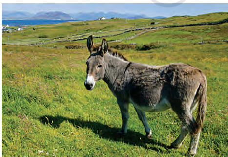
Figure 9.2 Mule

insemination. The semen is collected from the male that is chosen as a parent and injected into the reproductive tract of the selected female by the breeder. The semen may be used immediately or can be frozen and used at a later date. It can also be transported in a frozen form to where the female is housed. In this way desirable matings are carried. Artificial insemination helps us overcome several problems of normal matings. Can you discuss and list some of them?