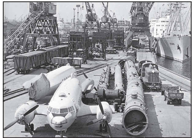
Fig. 9.6: Leningrad Commercial Port