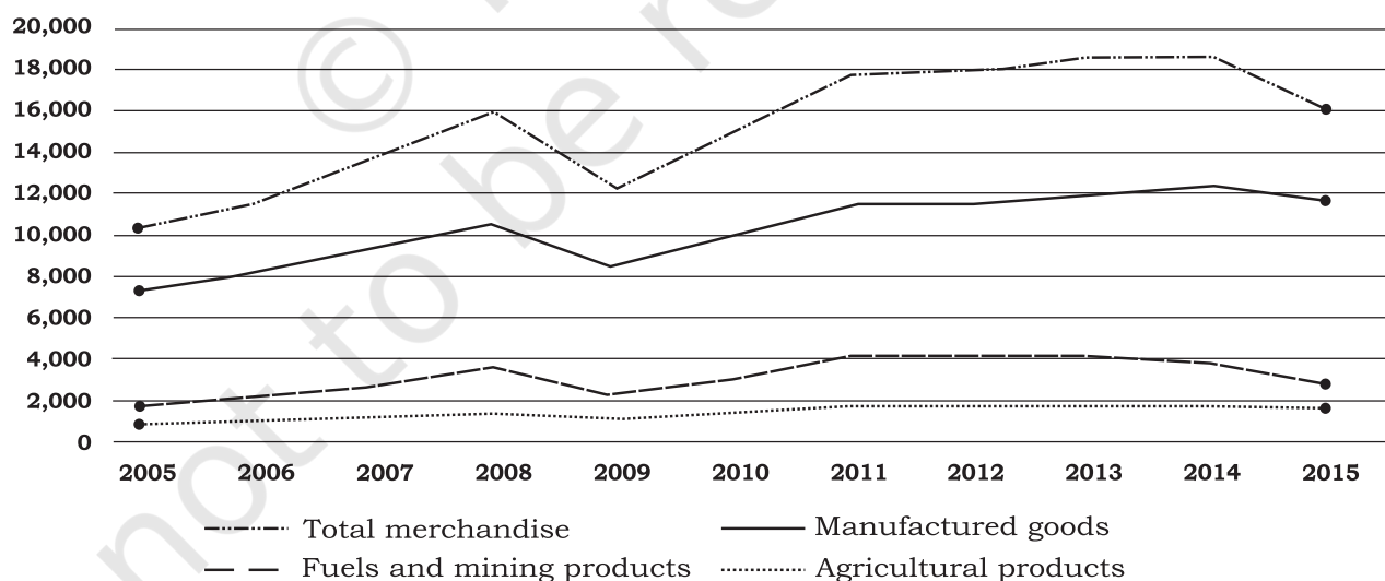
Fig. 9.1 World merchandise exports, 2005-2015

Source: wits.worldbank.org as on 21.07.17