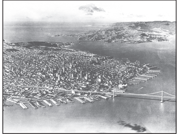
Fig. 9.5: San Francisco, the largest land-locked harbour in the world

The ports provide facilities of docking, loading, unloading and the storage facilities for cargo. In order to provide these facilities, the port authorities make arrangements for maintaining navigable channels, arranging tugs and barges, and providing labour and managerial services. The importance of a port is judged by the size of cargo and the number of ships handled. The quantity of cargo handled by a port is an indicator of the level of development of its hinterland.