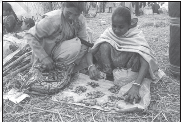
Fig. 9.1: Two women practising barter system in Jon Beel Mela

The initial form of trade in primitive societies was the barter system , where direct exchange of goods took place. In this system if you were a potter and were in need of a plumber, you would have to look for a plumber who would be in need of pots and you could exchange your pots for his plumbing service.