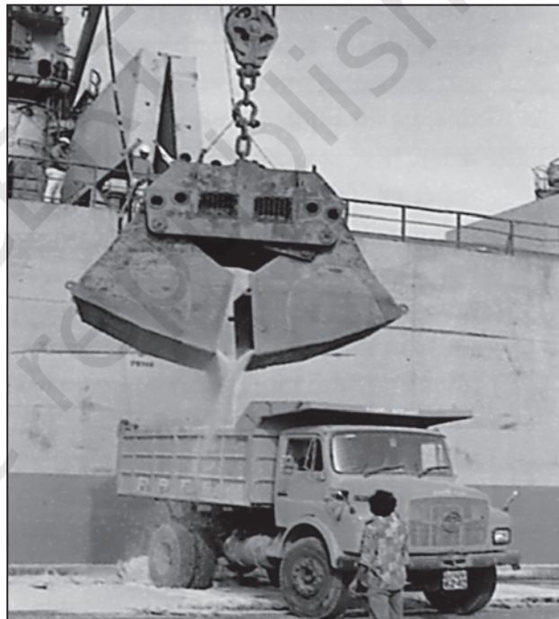
Fig. 11.3 : Unloading of goods on port

India is surrounded by sea from three sides and is bestowed with a long coastline. Water provides a smooth surface for very cheap transport provided there is no turbulence. India