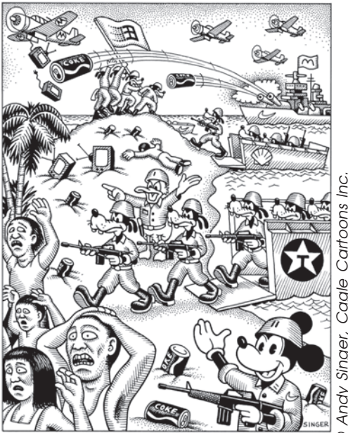
Invading new markets

The consequences of globalisation are not confined only to the sphere of politics and economy. Globalisation affects us in our home, in what we eat, drink, wear and indeed in what we think. It shapes what we think are our preferences. The cultural effect of globalisation leads to the fear that this process poses a threat to cultures in the world. It does so, because globalisation leads to the rise of a uniform culture or what is called cultural homogenisation. The rise of a uniform culture is not the emergence of a global culture. What we have in the name