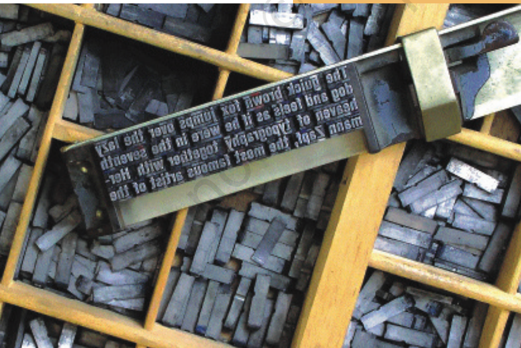
Lead type in compositor trays; (inset) type arranged and fixed in a temporary frame

—TAPATI GUHA-THAKURTA The Making of New Indian Art