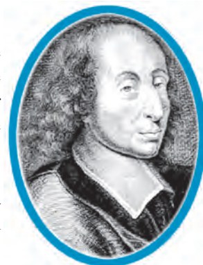
Blaise Pascal (1623-1662)

In earlier classes, we have learnt how to find the squares and cubes of binomials like a + b and a - b . Using them, we could evaluate the numerical values of numbers like (98)^2 = (100 - 2)^2 , (999)^3 = (1000 - 1)^3 , etc. However, for higher powers like (98)^5 , (101)^6 , etc., the calculations become difficult by using repeated multiplication. This difficulty was overcome by a theorem known as binomial theorem. It gives an easier way to expand (a + b)^n , where n is an integer or a rational number. In this Chapter, we study binomial theorem for positive integral indices only.