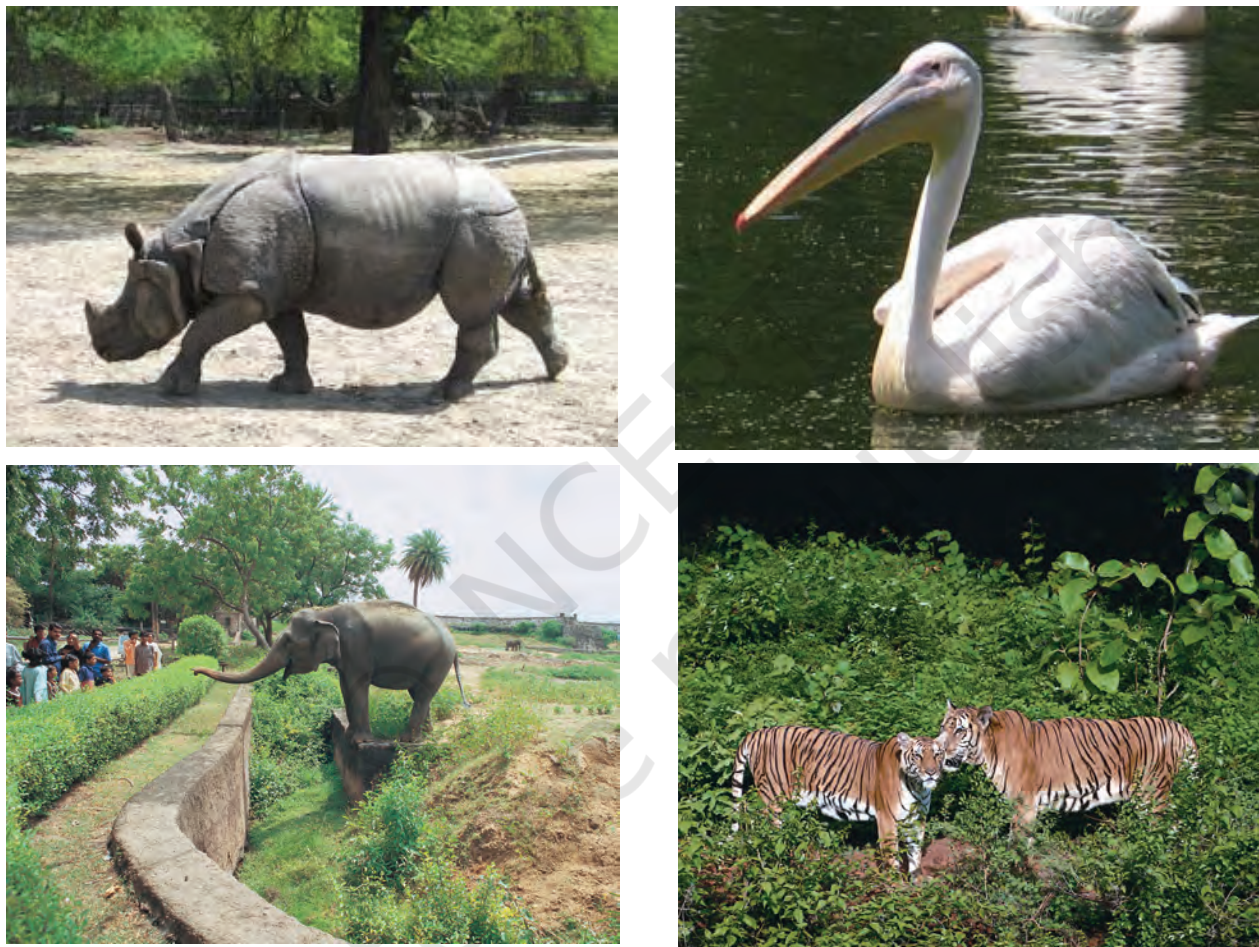
Figure 1.3 Pictures showing animals in different zoological parks of India

These are the places where wild animals are kept in protected environments under human care and which enable us to learn about their food habits and behaviour. All animals in a zoo are provided, as far as possible, the conditions similar to their natural habitats. Children love visiting these parks, commonly called Zoos (Figure 1.3).