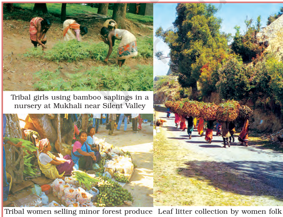
Tribal girls using bamboo saplings in a nursery at Mukhali near Silent Valley

Habitat destruction, hunting, poaching, over-exploitation, environmental pollution, poisoning and forest fires are factors, which have led to the decline in India's biodiversity. Other important causes of environmental destruction are unequal access, inequitable consumption of resources and differential sharing of responsibility for environmental well-being. Over-population in third world countries is often cited as the cause of environmental degradation. However, an average American consumes 40 times more resources than an average Somalian. Similarly, the richest five per cent of Indian society probably cause more ecological damage because of the amount they consume than