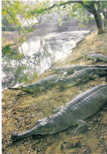
CRITICALLY ENDANGERED: Captive gharial at the Madras C

W ISPY tendrils of mist rise delicately from the water surface, tinged gold by the dawn. Your breath hangs as little clouds of vapour as you gaze upon the Girwa River on a cold winter morning. A trio of hollow clapping sounds from the other side of the river, half a kilometre away tells you that an adult male gharial is advertising his presence. It is the height of the breeding season. The place seems trapped in a time in early history when man was still clad in animal skins. It is only as the sun rises higher and burns the mist off the water that the world comes into focus with appalling clarity. The five-km stretch of the Girwa River in Katerniaghat Wildlife Sanctuary is one of the only three wild breeding sites left in the world for the most unique of all the