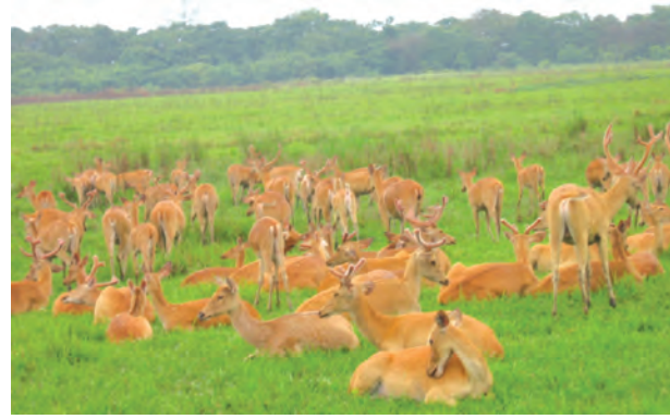
Fig. 2.4: Rhino and deer in Kaziranga National Park

dwindled to 1,827 from an estimated 55,000 at the turn of the century. The major threats to tiger population are numerous, such as poaching for trade, shrinking habitat, depletion of prey base species, growing human population, etc. The trade of tiger skins and the use of their bones in traditional medicines, especially in the Asian countries left the tiger population on the verge of extinction. Since India and Nepal provide habitat to about two-thirds of the surviving tiger population in the world, these two nations became prime targets for poaching and illegal trading.