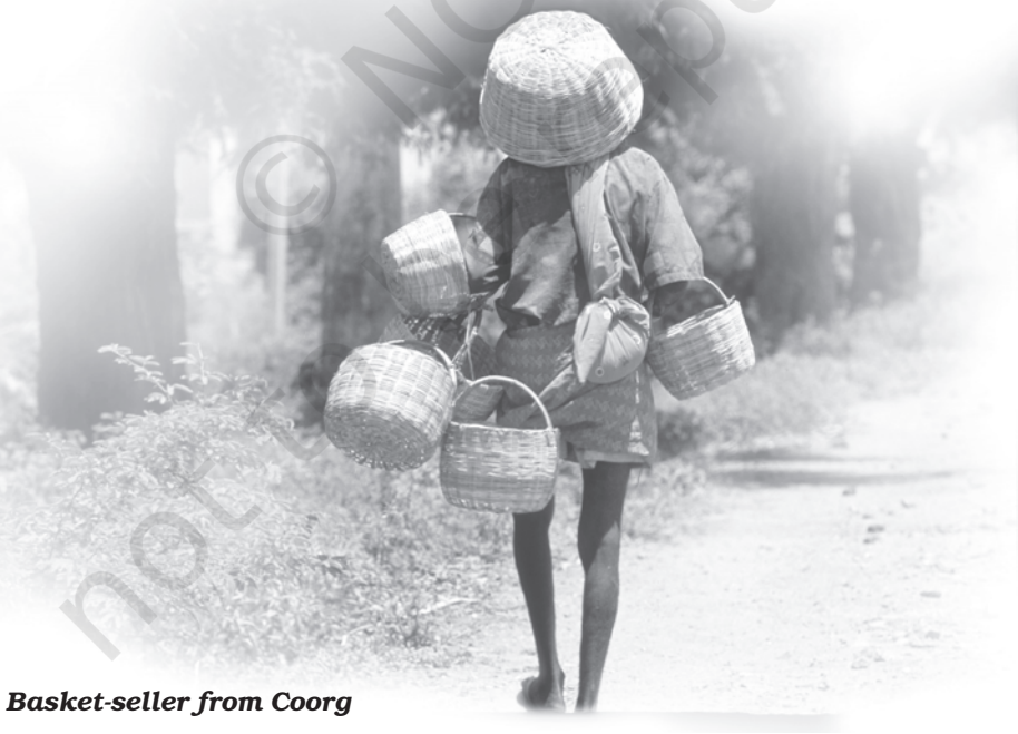
Basket-seller from Coorg