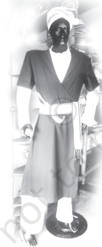
Traditional Coorgi dress