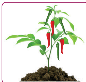
Fig. 7.1, Chilli Plant

A study of the yield of 200 chilli plants is recorded by a farmer and is given in Table 7.1.