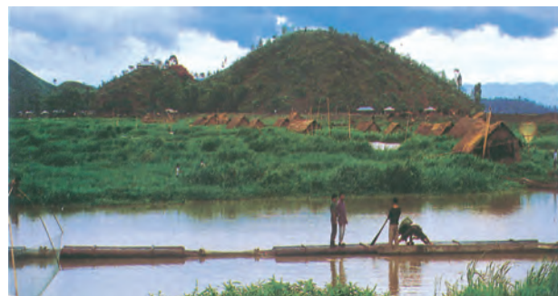
Figure 3.6 : Loktak Lake

Most of the freshwater lakes are in the Himalayan region. They are of glacial origin. In other words, they formed when glaciers dug out a basin, which was later filled with snowmelt. The Wular lake in Jammu and Kashmir, in contrast, is the result of tectonic activity. It is the largest freshwater lake in India. The Dal lake, Bhimtal, Nainital, Loktak and Barapani are some other important freshwater lakes.