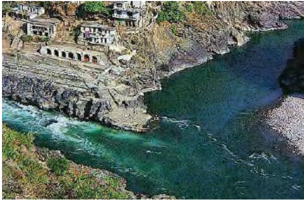
Figure 3.5 : Confluence of Bhagirathi and Alaknanda at Devaprayag

The Ganga is joined by many tributaries from the Himalayas, a few of them being major rivers, such as the Yamuna, the Ghaghara, the Gandak and the Kosi. The river Yamuna rises from the Yamunotri Glacier in the Himalayas. It flows parallel to the Ganga and as a right bank tributary meets the Ganga at Allahabad. The Ghaghara, the Gandak and the Kosi rise in the Nepal Himalaya. They are the rivers, which flood parts of the northern plains every year, causing widespread damage to life and property, whereas, they enrich the soil for agricultural use.