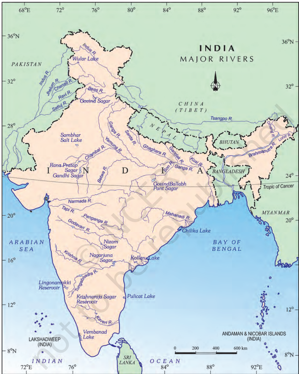
Figure 3.4 : Major Rivers and Lakes