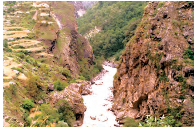
Figure 3.2 : A Gorge

Apart from originating from the two major physiographic regions of India, the Himalayan and the Peninsular rivers are different from each other in many ways. Most of the Himalayan rivers are perennial . It means that they have water throughout the year. These rivers receive water from rain as well as from melted snow from the lofty mountains. The two major Himalayan rivers, the Indus and the Brahmaputra originate from the north of the mountain ranges. They have cut through the mountains making gorges. The Himalayan rivers have long courses from their source to the sea.