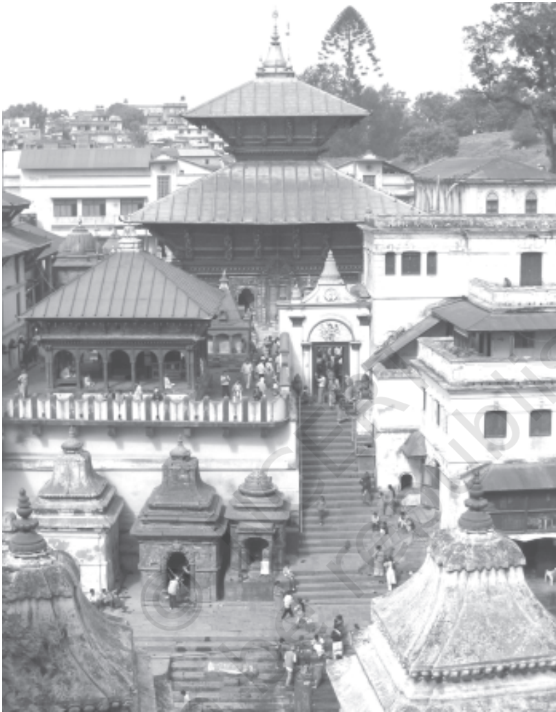
Pashupatinath Temple, Kathmandu

that flows below. A corpse is being cremated on its banks; washerwomen are at their work and children bathe. From a balcony a basket of flowers and leaves, old offerings now wilted, is dropped into the river. A small shrine half protrudes from the stone platform on the river bank. When it emerges fully, the goddess inside will escape, and the evil period of the Kaliyug will end on earth.