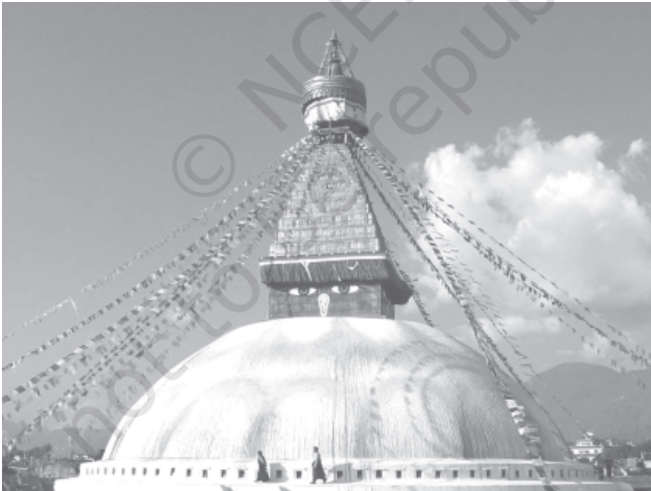
The Baudhnath Stupa, Kathmandu