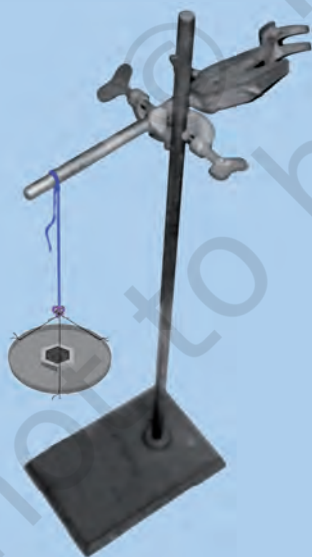
Fig. 3.5: An iron stand with a thread hanging from the clamp

Take an iron stand with a clamp. Take a cotton thread of about 60 cm length. Tie it to the clamp so that it hangs freely from it as shown in Fig. 3.5. At the free end suspend