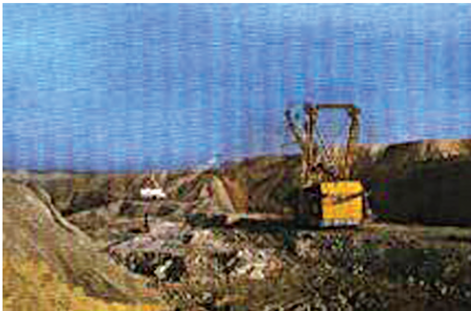
Fig. 5.2: A coal mine

When heated in air, coal burns and produces mainly carbon dioxide gas.