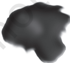
Fig. 5.3: Coal tar

It is a black, thick liquid (Fig. 5.3) with an unpleasant smell. It is a mixture of