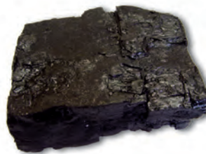
Fig. 5.1: Coal

You may have seen coal or heard about it (Fig. 5.1). It is as hard as stone and is black in colour.