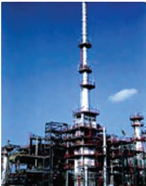
Fig. 5.5: A petroleum refinery

separating the various constituents/fractions of petroleum is known as refining. It is carried out in a petroleum refinery (Fig. 5.5).