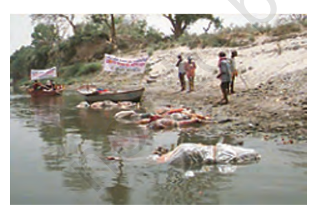
Fig. 18.8: A polluted stretch of the river Ganga

Let us take a specific example to understand the situation. The Ganga at Kanpur in Uttar Pradesh (U.P.), has one of the most polluted stretches of the river (Fig. 18.8). Kanpur is one of the most populated towns in U.P.