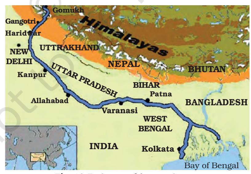
Fig. 18.7: Course of the river Ganga

Ganga is one of the most famous rivers of India (Fig. 18.7). It sustains most of the northern, central and eastern Indian population. Millions of people depend on it for their daily needs and