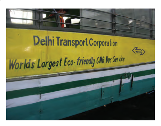
Fig. 18.5: A public transport bus powered by CNG

There are many success stories in our fight against air pollution. For example, a few years ago, Delhi was one of the most polluted cities in the world. It was being choked by fumes released from automobiles running on diesel and petrol. A decision was taken to switch to fuels like CNG (Fig. 18.5) and