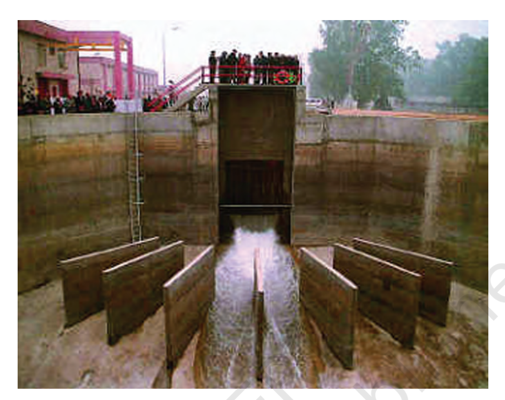
Fig. 18.10: Water treatment plant

water used for washing vegetables may be used to water plants in the garden.