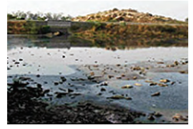
Fig. 18.9 : Industrial waste discharged into a river

Many industries discharge harmful chemicals into rivers and streams, causing the pollution of water (Fig. 18.9). Examples are oil refineries, paper factories, textile and sugar mills