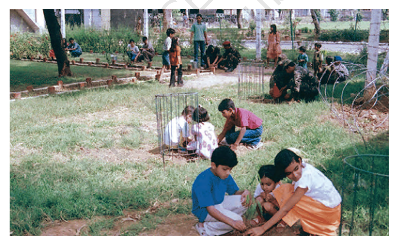
Fig. 18.6: Children planting saplings

Small contributions on our part can make a huge difference in the state of the environment. We can plant trees and nurture the ones already present in the neighbourhood. Do you know about Van Mahotsav , when lakhs of trees are planted in July every year (Fig. 18.6)?