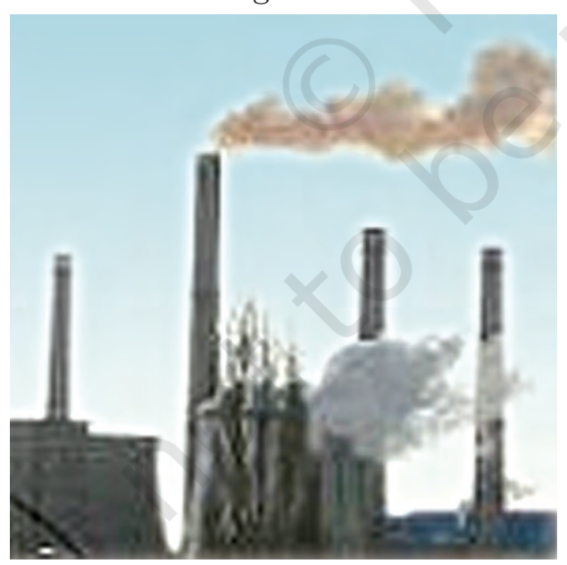
Fig. 18.2: Smoke from a factory

The substances which contaminate the air are called air pollutants . Sometimes, such substances may come from natural sources like smoke and dust arising from forest fires or volcanic eruptions. Pollutants are also added to the atmosphere by certain human activities. The sources of air pollutants are factories (Fig. 18.2), power plants, automobile exhausts and burning of firewood and dung cakes.