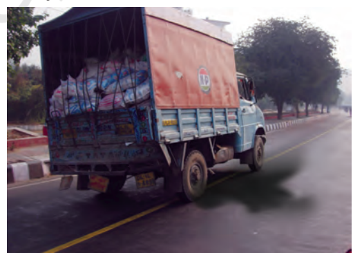
Fig. 18.3: Air pollution due to automobiles

Vehicles produce high levels of pollutants like carbon monoxide, carbon dioxide, nitrogen oxides and smoke (Fig. 18.3). Carbon monoxide is produced from incomplete burning of fuels such as petrol and diesel. It is a poisonous gas. It reduces the oxygen-carrying capacity of the blood.