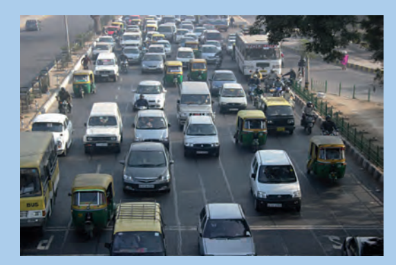
Fig. 18.1: A congested road in a city