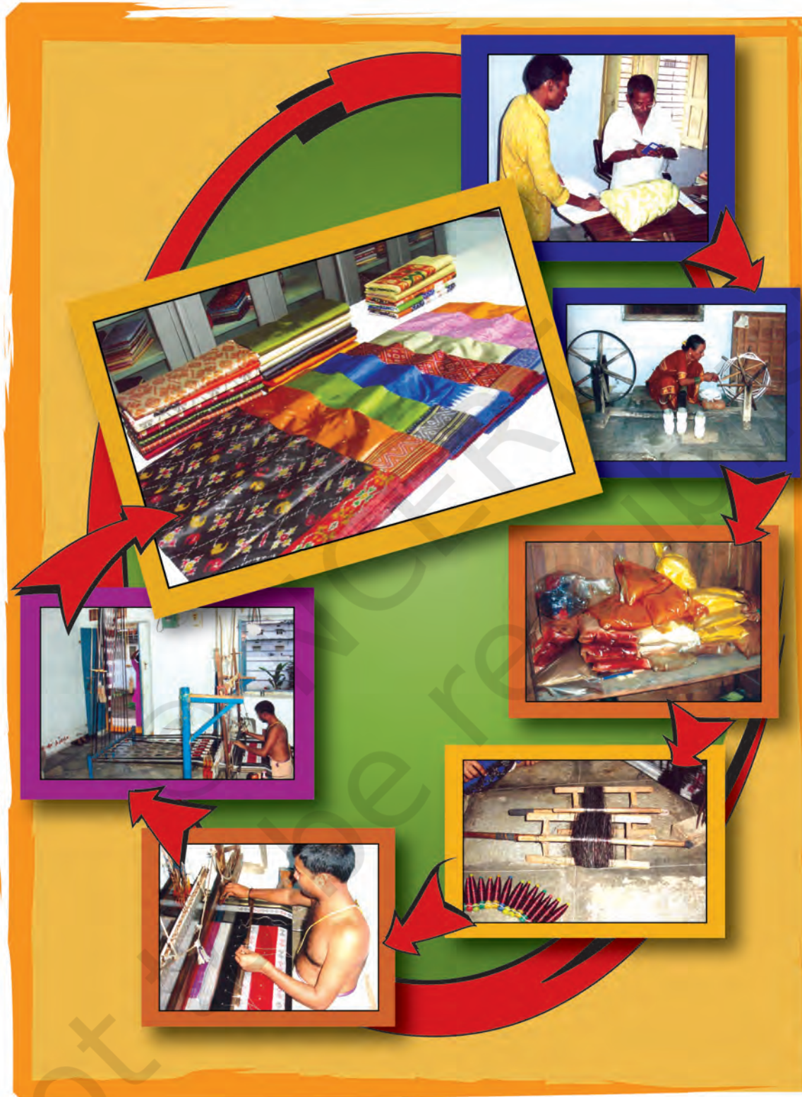
Process of making pochampalli sarees