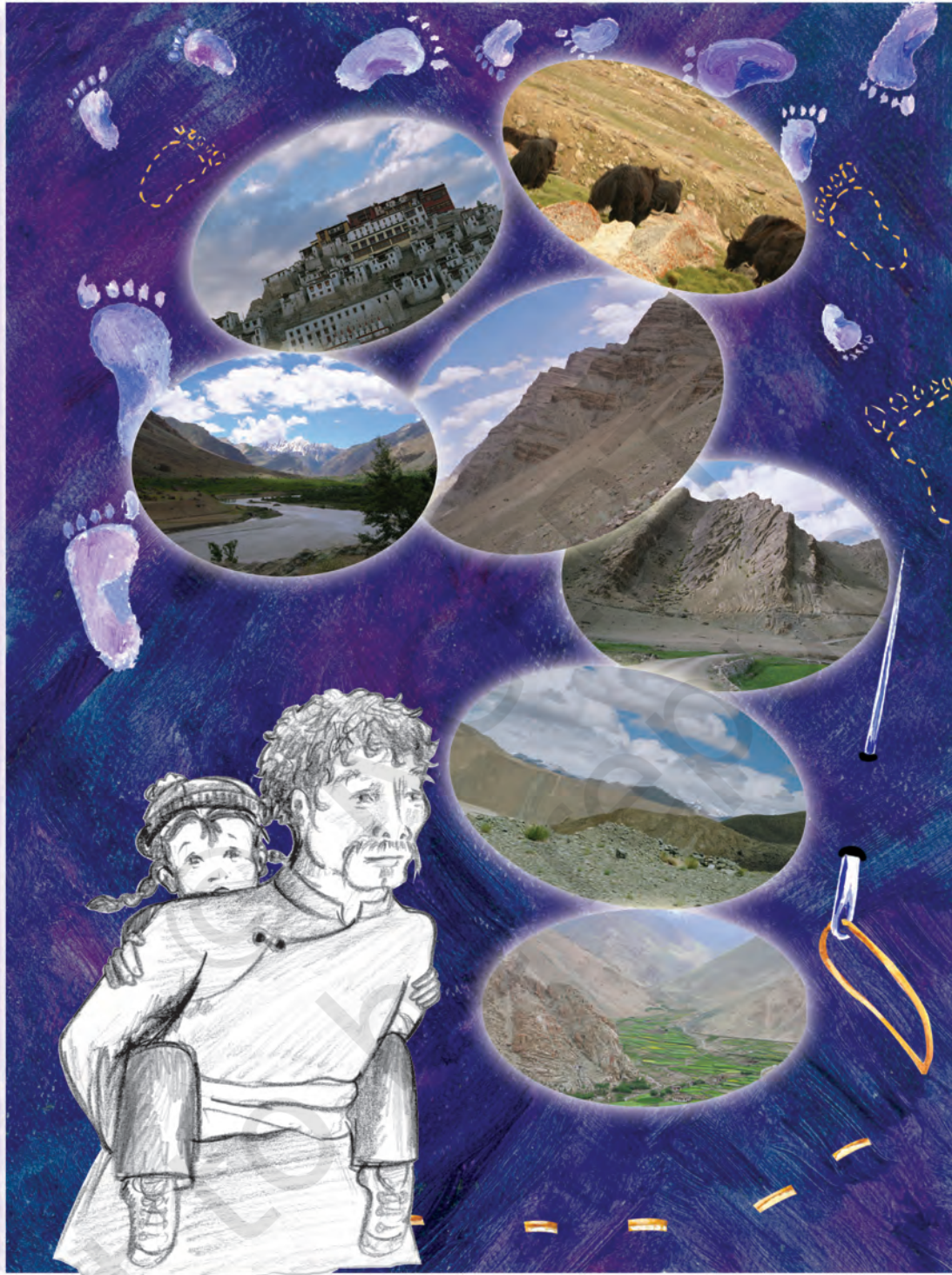
Chuskit amongst photographs from Ladakh