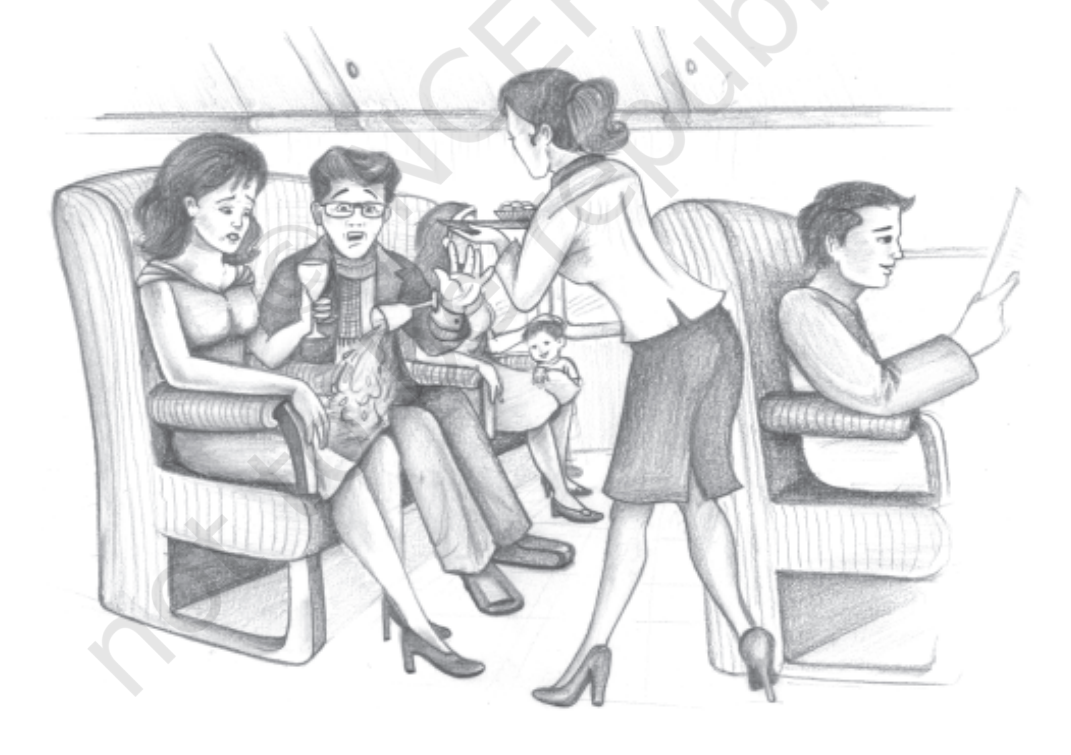
58 / Moments

This, however, was not my worst experience on a plane flight. My worst experience was when I was writing important thoughts in a notebook ('buy socks', 'clutch drinks carefully', etc.), sucking thoughtfully on the end of my pen as you do, and fell into