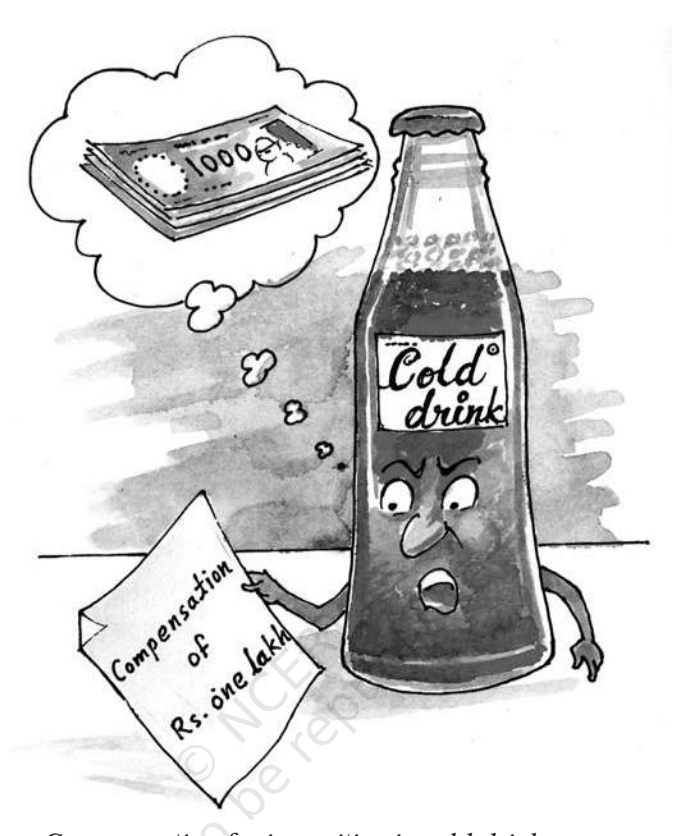
Compensation for impurities in cold drinks

(iii) Widespread Exploitation of Consumers: Consumers might be exploited by unscrupulous, exploitative and unfair trade practices like defective and unsafe products, adulteration, false and misleading advertising, hoarding, black- marketing, etc. Consumers need protection against such malpractices of the sellers.