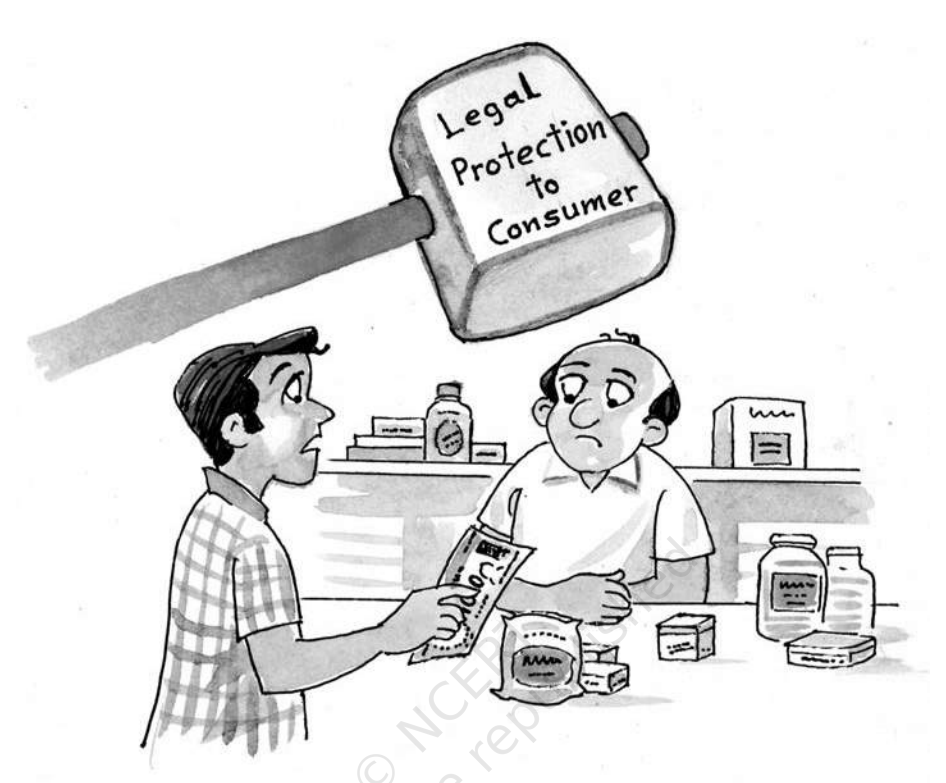
Protection against malpractices and exploitation

through electronic means or by teleshopping or direct selling or multilevel marketing. However, any person who obtains goods or avails