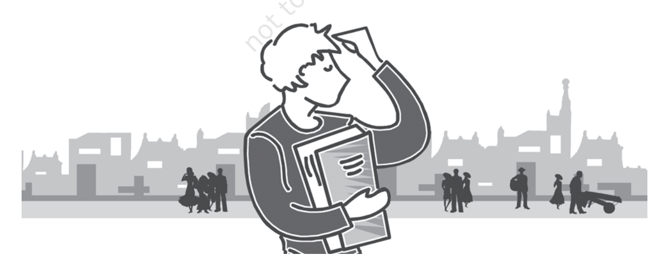
The Last Lesson/3

I jumped over the bench and sat down at my desk. Not till then, when I had got a little over my fright, did I see that our teacher had on his beautiful green coat, his frilled