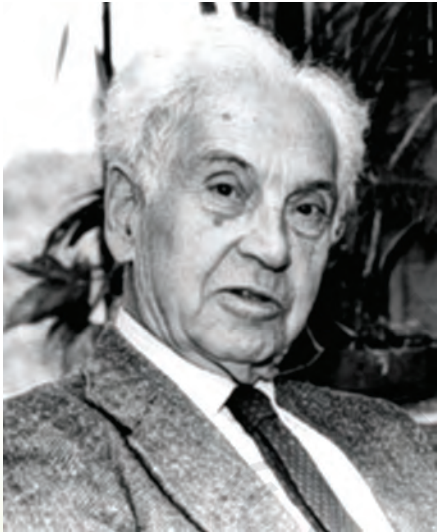
Ernst Mayr (1904 – 2004)

Born on 5 July 1904, in Kempten, Germany, ERNST MAYR, the Harvard University evolutionary biologist who has been called 'The Darwin of the 20 th century', was one of the 100 greatest scientists of all time. Mayr joined Harvard's Faculty of Arts and Sciences in 1953 and retired in 1975, assuming the title Alexander Agassiz Professor of Zoology Emeritus . Throughout his nearly 80-year career, his research spanned ornithology, taxonomy, zoogeography, evolution, systematics, and the history and philosophy of biology. He almost single-handedly made the origin of species diversity the central question of evolutionary biology that it is today. He also pioneered the currently accepted definition of a biological species. Mayr was awarded the three prizes widely regarded as the triple crown of biology: the Balzan Prize in 1983, the International Prize for Biology in 1994, and the Crafoord Prize in 1999. Mayr died at the age of 100 in the year 2004.