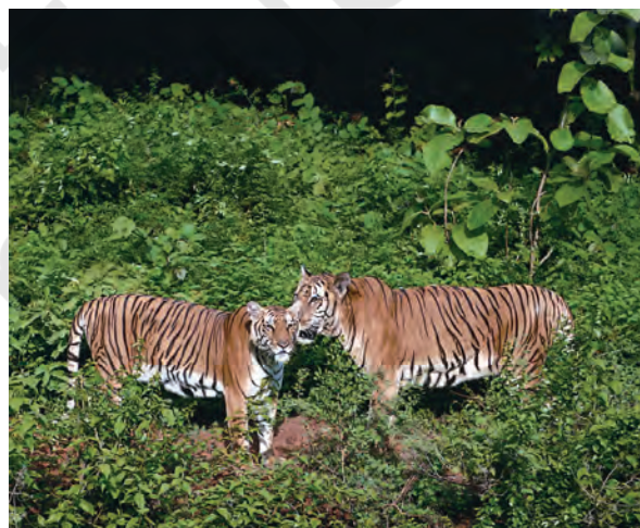
Figure 1.3 Pictures showing animals in different zoological parks of India