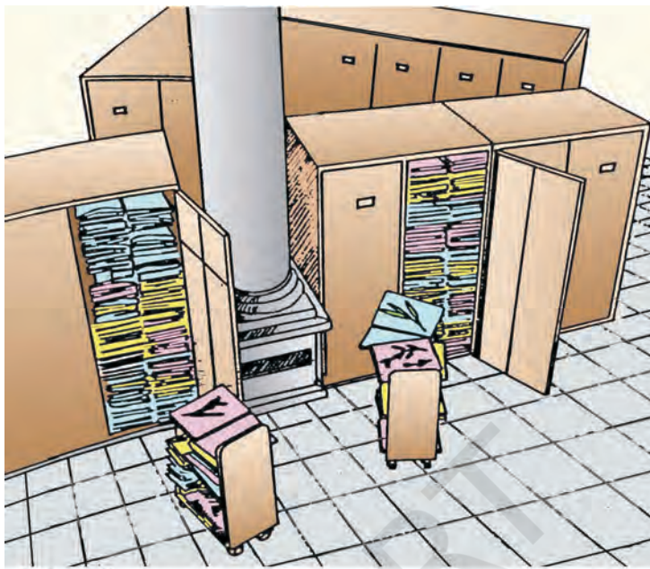
Figure 1.2 Herbarium showing stored specimens

according to a universally accepted system of classification. These specimens, along with their descriptions on herbarium sheets, become a store house or repository for future use (Figure 1.2). The herbarium sheets also carry a label providing information about date and place of collection, English, local and botanical names, family, collector's name, etc. Herbaria also serve as quick referral systems in taxonomical studies.