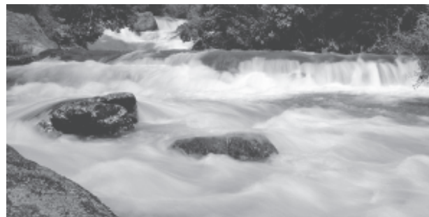
Figure 3.3 : Rapids

The Himalayan drainage system has evolved through a long geological history. It mainly includes the Ganga, the Indus and the Brahmaputra river basins. Since these are fed both by melting of snow and precipitation, rivers of this system are perennial. These rivers pass through the giant gorges carved out by the erosional activity carried on simultaneously with the uplift of the Himalayas. Besides deep gorges, these rivers also form V-shaped valleys, rapids and waterfalls in their mountainous