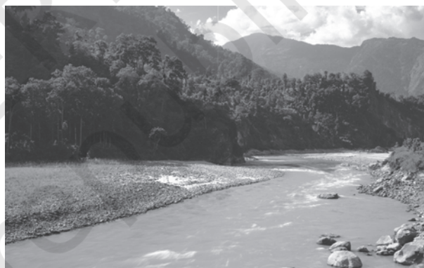
Figure 3.1 : A River in the Mountainous Region

2006) in this class. Can you, then, explain the reason for water flowing from one direction to the other? Why do the rivers originating from the Himalayas in the northern India and the Western Ghat in the southern India flow towards the east and discharge their waters in the Bay of Bengal?